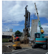
Drilling site in Meyrin, GE (July 2017)

In the context of geothermal energy, social science studies make a valuable contribution to public engagement procedures for siting, planning and risk governance. As there is no uniform perception of geothermal technology across a territory, it is important to take into account multiple scales, actors and contexts in order to gain an insight of the local characteristics of each site (Majer et al. 2012; Trutnevyte & Ejderyan, 2017).