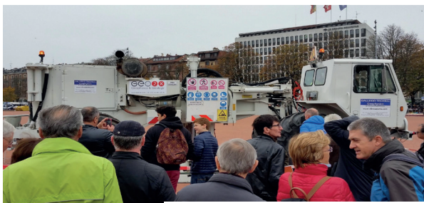
Public information event on Plainpalais in Geneva (October 2016,)