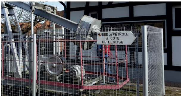
Petroleum museum in Pechelbronn, Northern Alsace. The historical context of oil extraction played an important role for the acceptance of nearby DGE plants of Soultz-sous Forêt and Rittershoffen

We conducted a review of context analysis guidelines for infrastructure development in the sectors of energy, planning, development aid, transport, and hydraulic engineering to identify how practitioners categorize elements of context. We specifically focused on existing guidelines for DGE and carbon capture and storage (CSS) to see which elements of context are addressed and how (see table below).